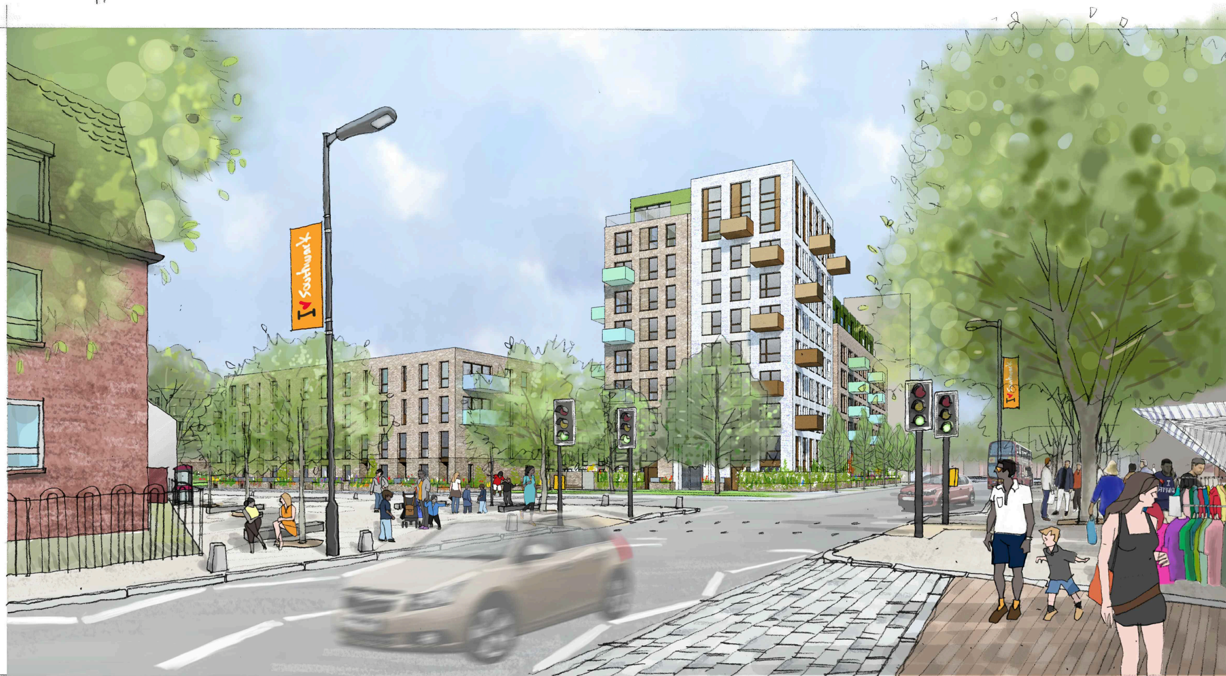
VIEW 1 - Thurlow Street