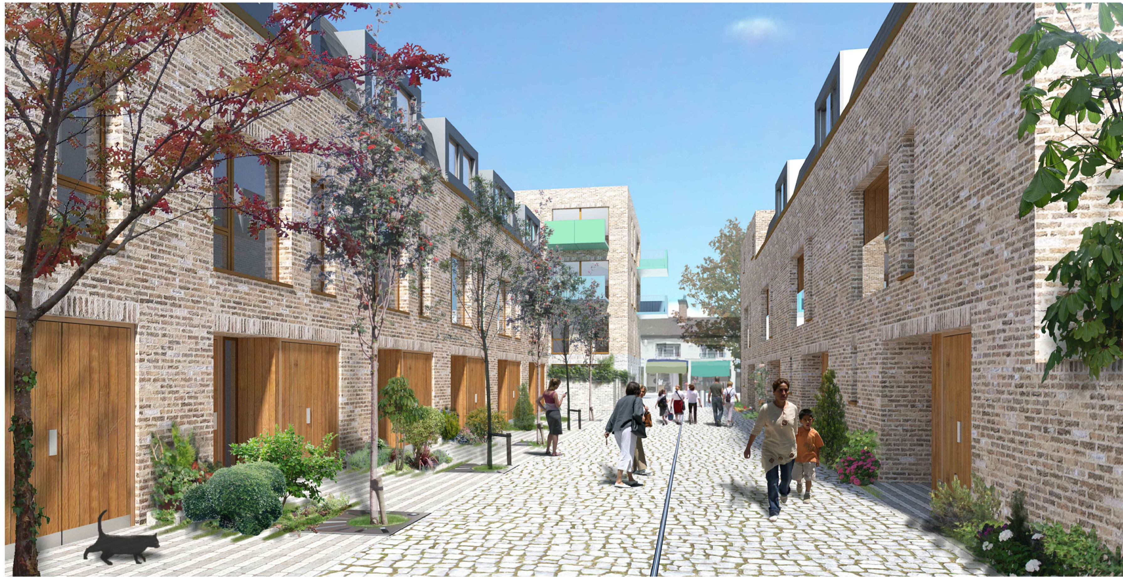
VIEW 3 - Mews