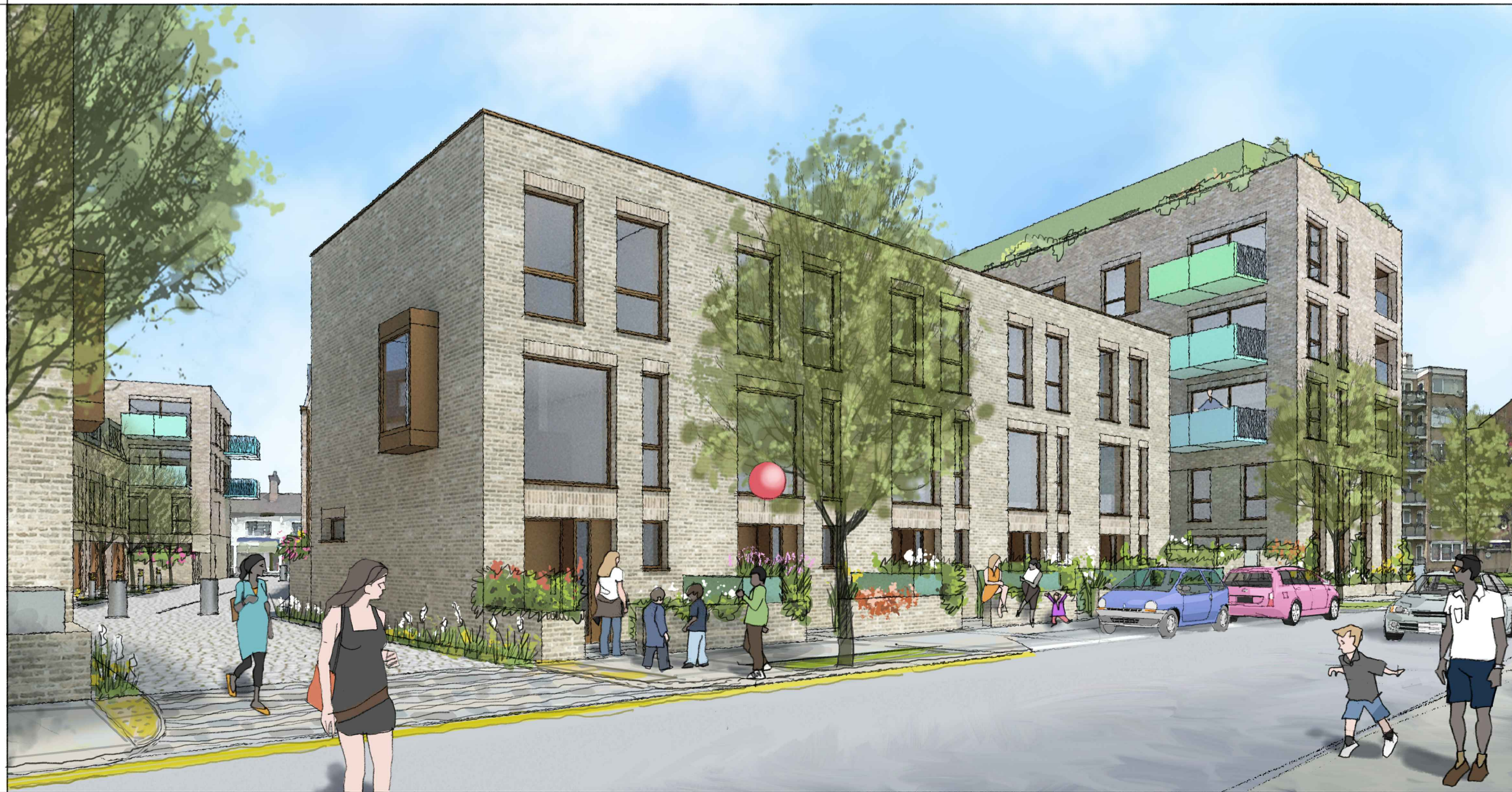
VIEW 4 - Southern Street