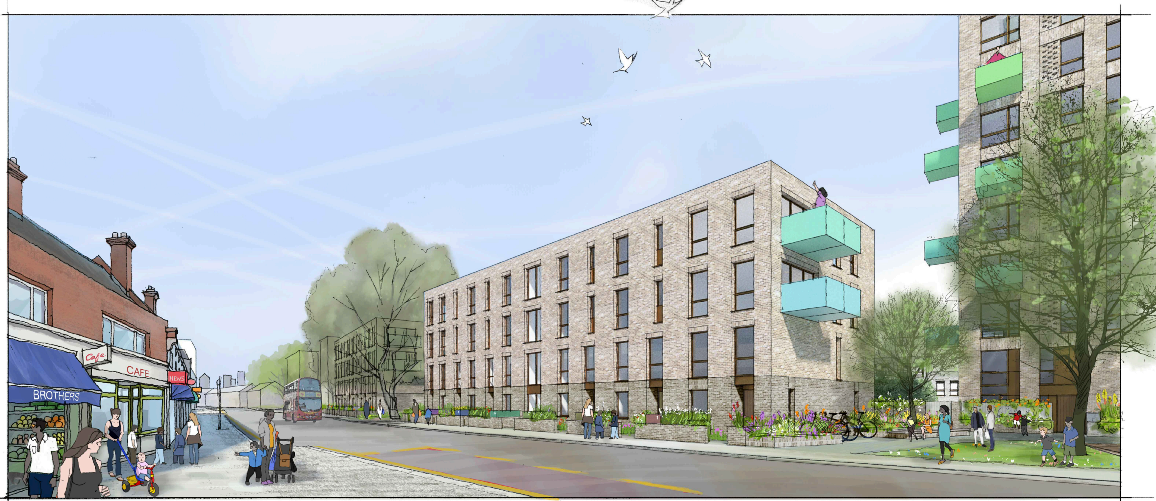
VIEW 2 - East Street